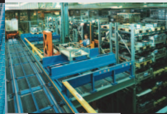
Pallet conveyor for euro, mesh, steel and special pallets