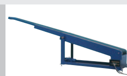
Telescopic belt conveyor for vehicle loading / unloading