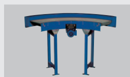
Belt bend 90°

Overall, Max Dörr Förderanlagen GmbH concentrates on the use of the latest technologies for integrated and long lasting solutions. The emphasis being on speed, flexibility, innovation and customer specific service.