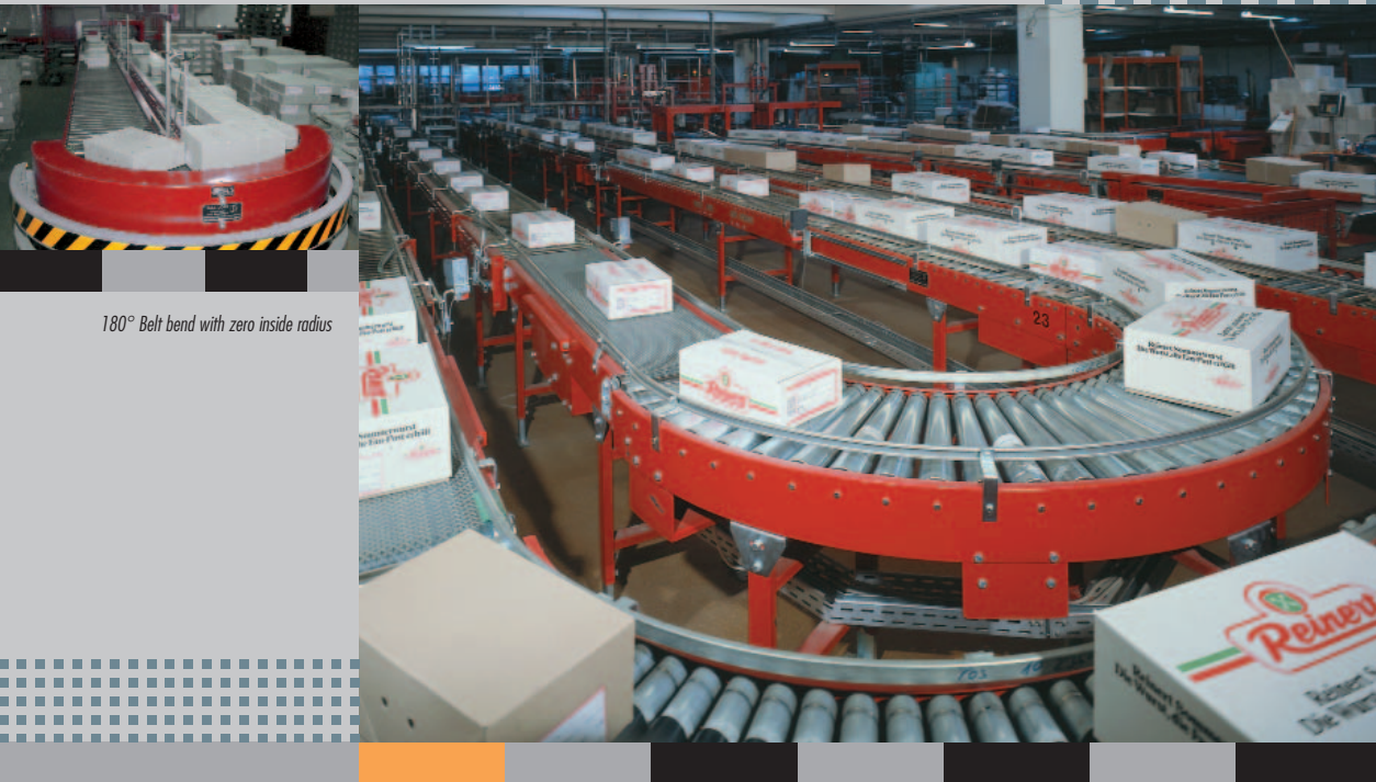
180° Belt bend with zero inside radius